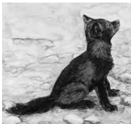
Figure 7. Changes in the foxes' coat color were the first novel traits noted, appearing in the eighth to tenth selected generations. The expression of the traits varied, following classical rules of genetics. In a fox homozygous for the Star gene, large areas of depigmentation similar to those in some dog breeds are seen ( top ). In addition some foxes displayed the brown mottling seen in some dogs, which appeared as a semirecessive trait.

tion. Fur farmers have tried for decades to breed foxes that would reproduce more often than annually, but all their attempts have failed.